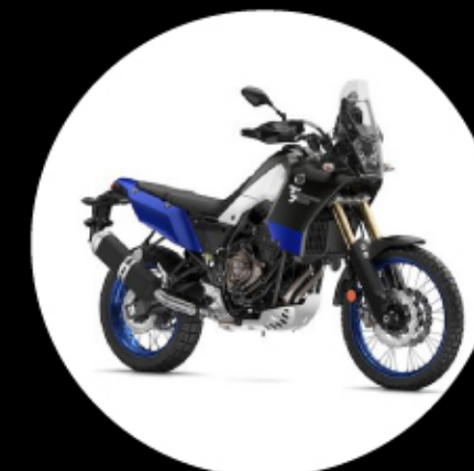
MT-10 Tourer Edition