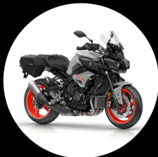
MT-10 Tourer Edition