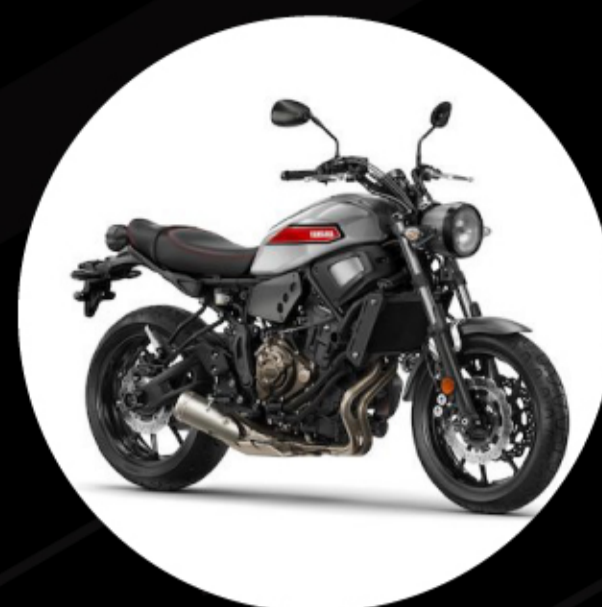
MT-10 Tourer Edition