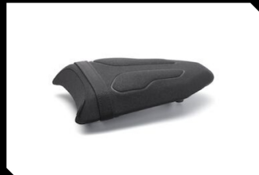
Accessories & Apparels