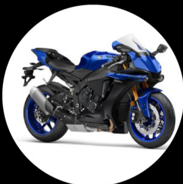
MT-10 Tourer Edition