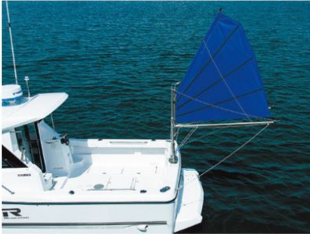
Roman strike spanker