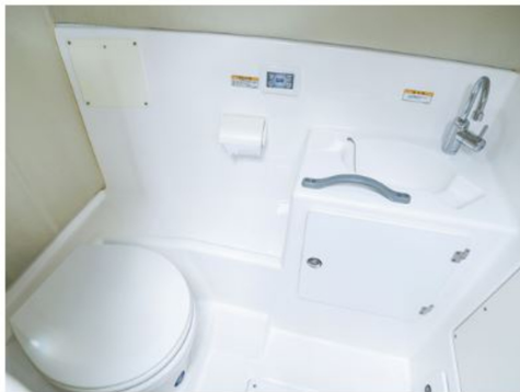
Private toilet room