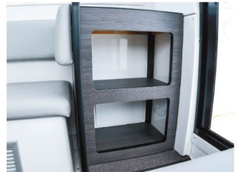
Locker unit (factory option)