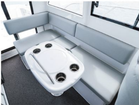
Cabin table and port passenger seat