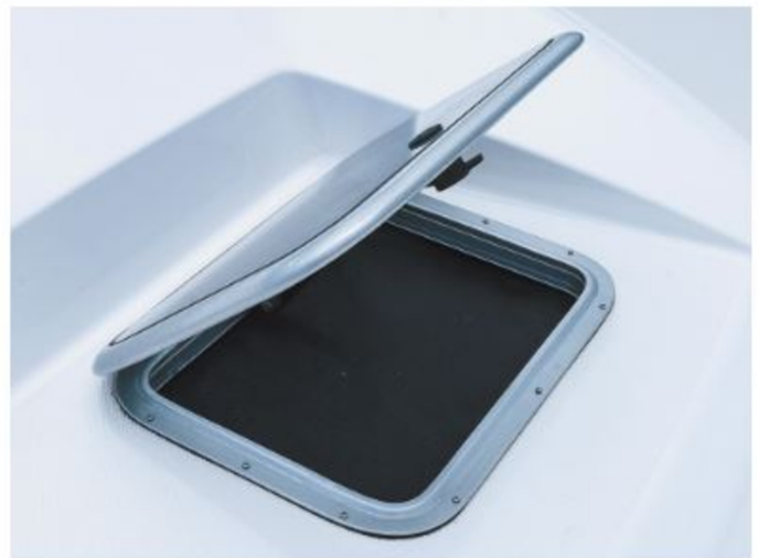
Bausky Light Hatch