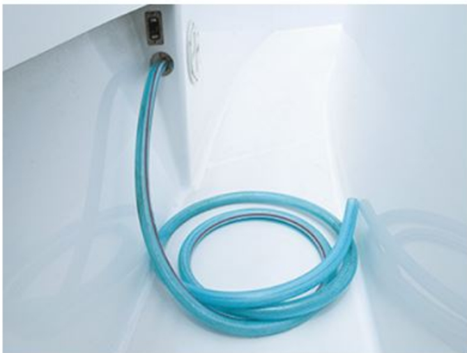
Bow deck wash