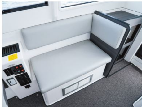
Starboard passenger seat