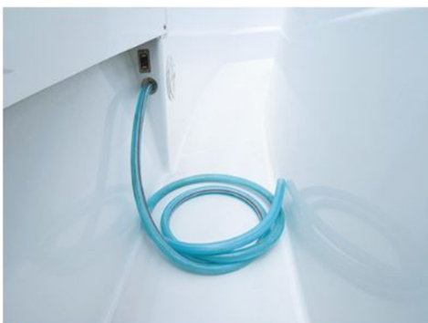
Bow deck wash (optional)