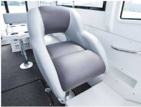
Navi seat (damper specification)