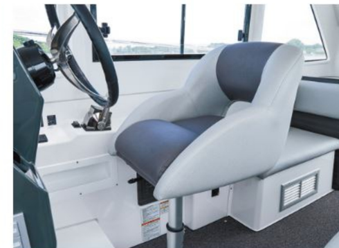
Driver's seat (damper specification)