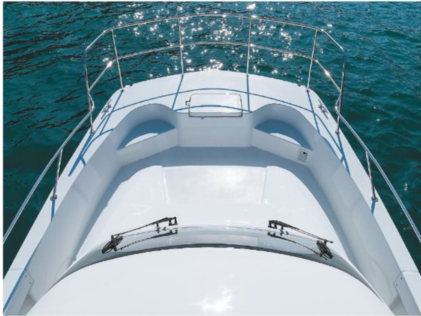
Square bow / bowler