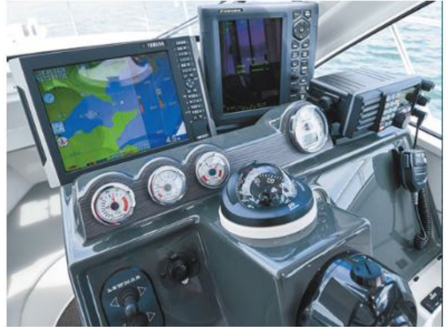
GPS, fish finder, radar, radio, compass

* The photo includes options and props for shooting.