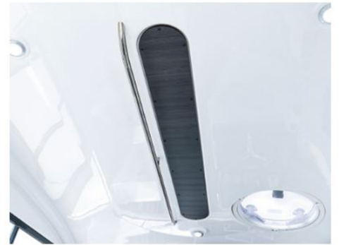
Ceiling storm rail