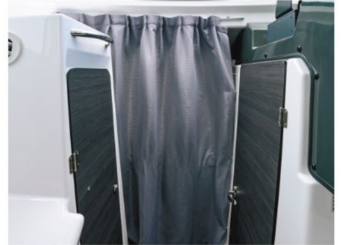
Bow berth curtain (factory option)