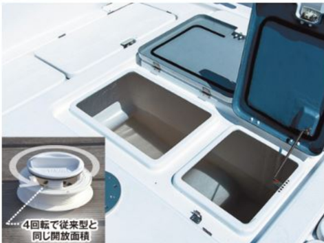
Ikes and Ikes Scapper (EZ Cap)