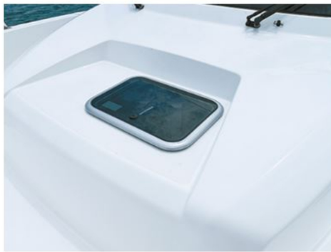
Bow fishing seat