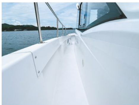
Semi-walk around deck