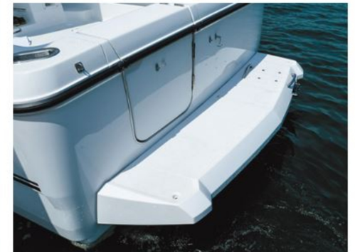
Transom step (FRP)