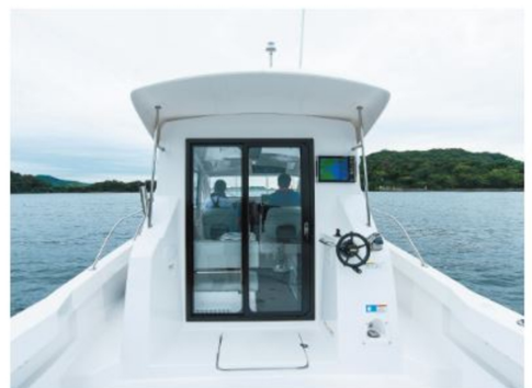
Bridge rear / cabin door