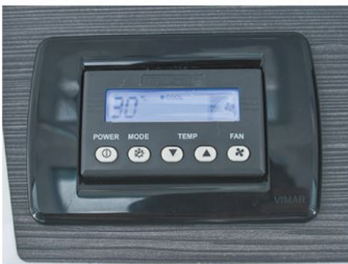
Air conditioner (BE-COOL)